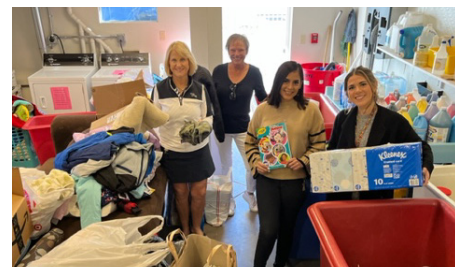
Spirit of Giving